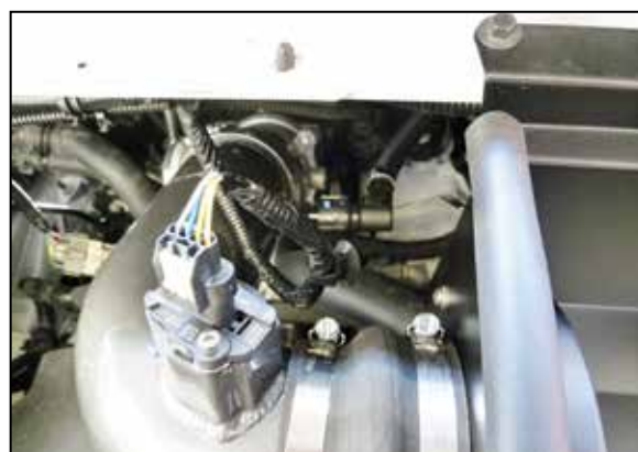
16. Connect the CCV quick connect fitting and mass air sensor electrical connection.