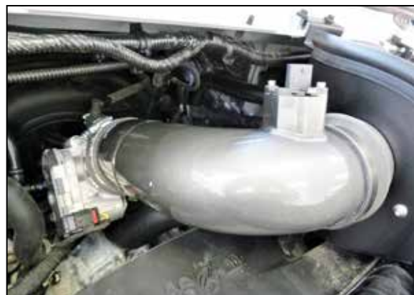
15. Install the K&N intake tube into the coupler at the throttle body and then into the coupler at the filter adapter, adjust for best fit and then secure with the provided hose clamps.