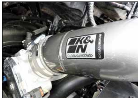
18. Apply the K&N decal where shown.