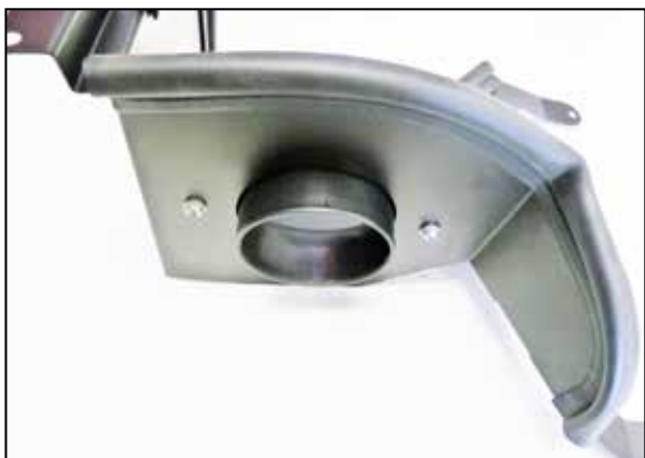
10. Install the filter adapter into the heat shield using the provided hardware.