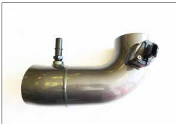
12. Remove the mass air sensor from the factory housing and install it into the K&N intake tube using the provided hardware. Install the provided CCV quick connect fitting into the K&N intake tube. NOTE: Be sure to use thread sealant on the threads of the supplied CCV fitting.