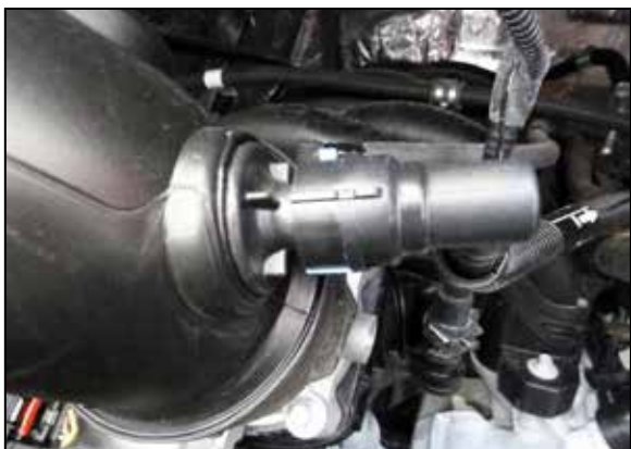
7. Disconnect the CCV quick connect fitting near the throttle body.