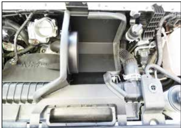
11. Install the heat shield assembly into the vehicle, position the provided spacers under the rear mounting location and then secure with the factory air filter housing mounting hardware.