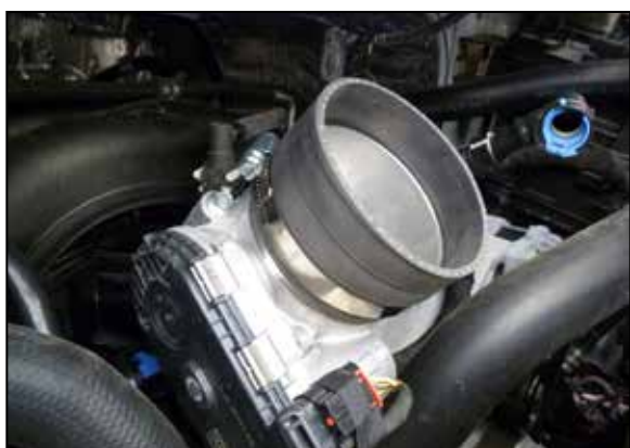
14. Install the provided straight coupler onto the throttle body and secure with provided hose clamp.