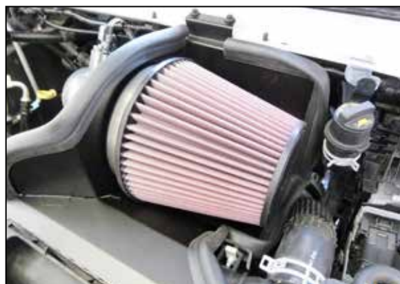
17. Install the K&N air filter and secure with the provided hose clamp.