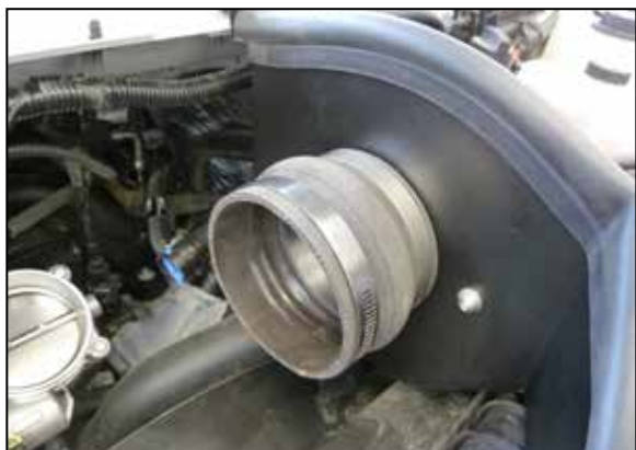
13. Install the provided hump coupler onto the filter adapter and secure with the provided hose clamp.