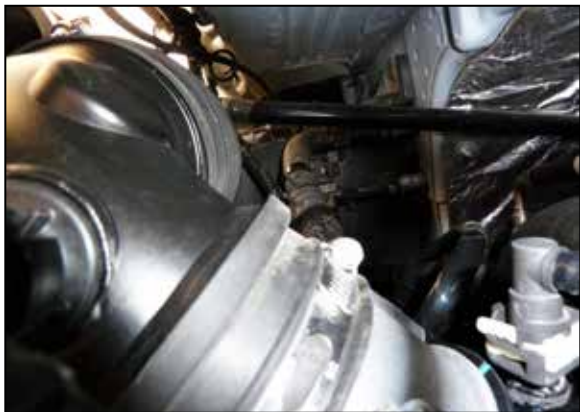
8. Loosen the hose clamp that secures the intake tube to the throttle body and then remove the intake tube from the vehicle.