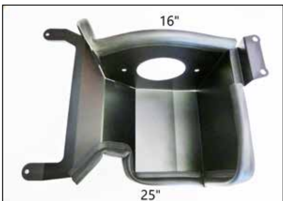
9. Cut the provided edge trim to 16" and 25" and then install onto the K&N heat shield as shown.