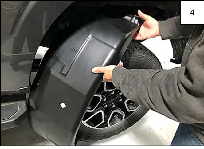
Slide the Rear Wheel Well Liner behind wheel at rear of vehicle. It is helpful to tilt the liner at a 45-degree angle at front of wheel and then straighten it out once it's behind the wheel.

If you do not have factory flares, skip to Step 4.