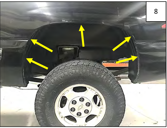
If you removed the factory fender flares, drill a 1/4" hole through holes in sheet metal and into wheel well liner (5 locations).

If you do not have factory flares, skip to Step 10.