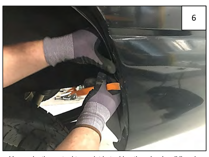
Use a plastic pry tool to assist in tucking the wheel well liner in place.