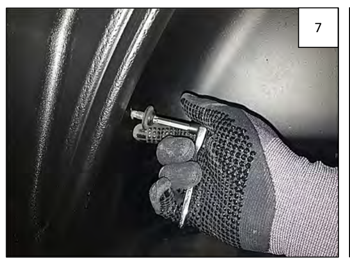
Reinstall factory fasteners removed in Step 2, making sure each fastener is threaded into the support strut.