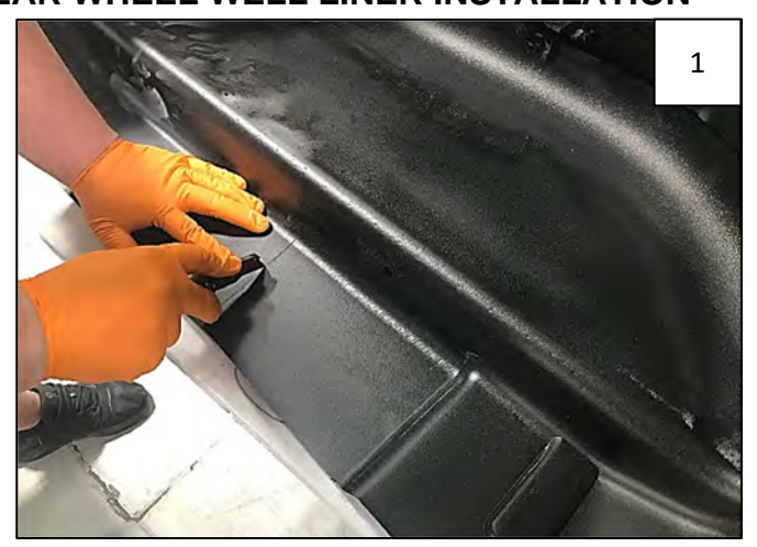
If you have aftermarket wheel well components, such as a rear air spring kit, first cut the wheel well liner in the area that will interfere.