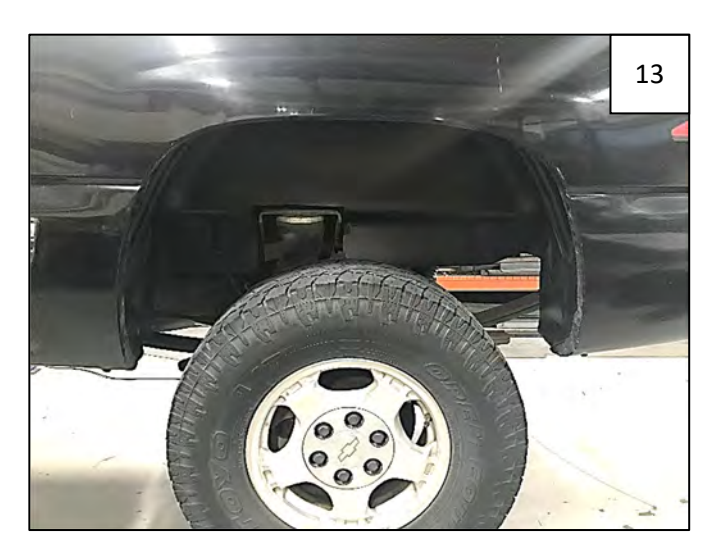
Installation is complete. Repeat for other side.