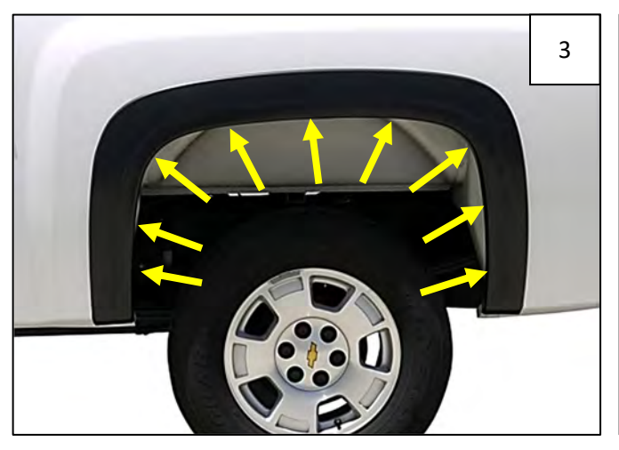
If your vehicle is equipped with factory fender flares, remove and discard 9 push pins that keep the flare in place. Remove flare and save for reinstallation.

NOTE : Factory liner must be removed prior to installation.