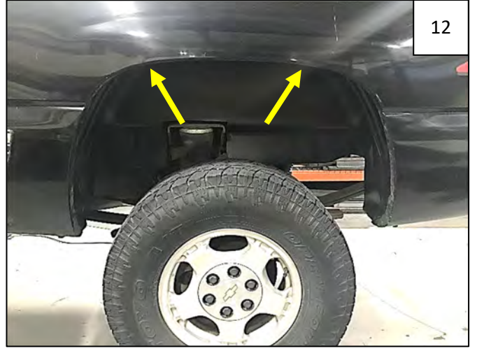
Install a supplied Plastic Retainer through upper holes in fender lip and into holes in wheel well liner at locations indicated by arrows.