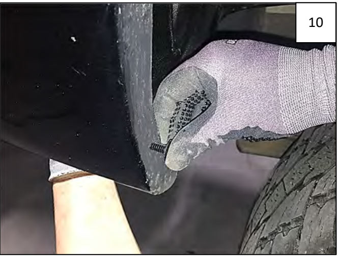
While holding liner in place at inside of sheet metal, insert a supplied Plastic Retainer through factory hole in sheet metal and into predrilled hole in liner.