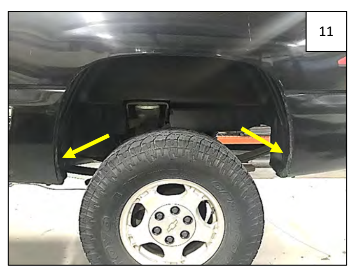
Lower Hole locations.