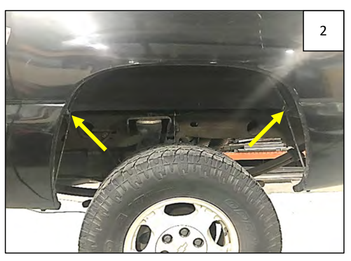
Using a 13mm socket or T40 Torx bit, depending on model, remove 2 factory fasteners within wheel well. Retain these fasteners for future use.

NOTE : Factory liner must be removed prior to installation.