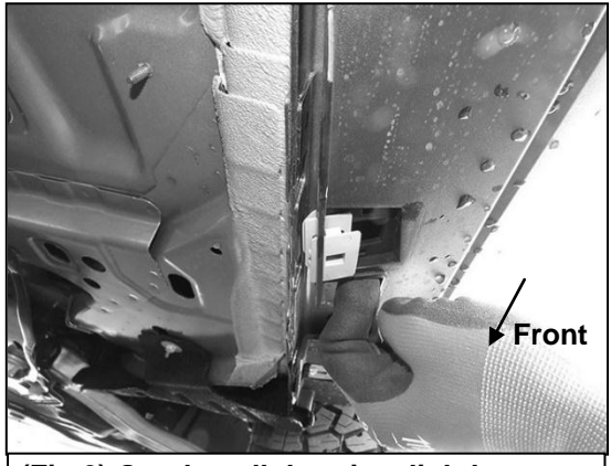
(Fig 2) Gently pull the trim slightly to loosen the clips (Passenger side shown)