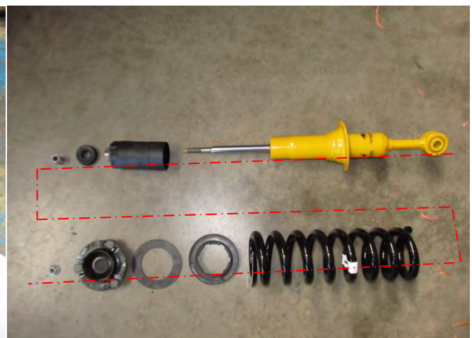
Figure 2: Strut assembly component order